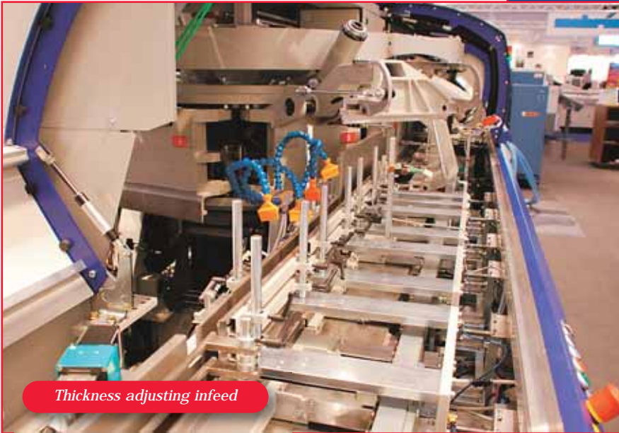
Thickness adjusting infeed

Kolbus have developed the new KM200 perfect binder to be the ideal solution in any short run environment where multiple titles are produced to a common format. Typically digital web presses are producing standard format sizes from the same web width and cannot change format without stopping; the only variable is the product thickness.