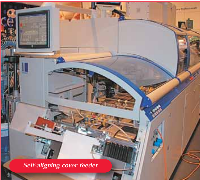
Self-aligning cover feeder

needs to drop books into the KM200s feeder and from there on all adjustments are made automatically with top quality perfect bound products being produced at speeds of up to 5,000 copies/hour.