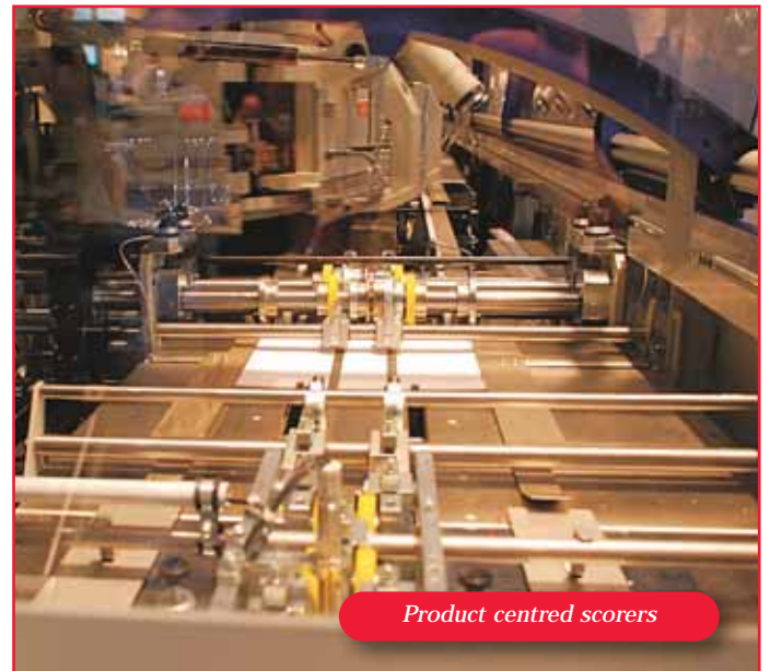
Product centred scorers

First deliveries of the Kolbus KM200 are in stand-alone format but it is envisaged that they could be linked with an upstream converting machine, producing either sections or loose sheets.